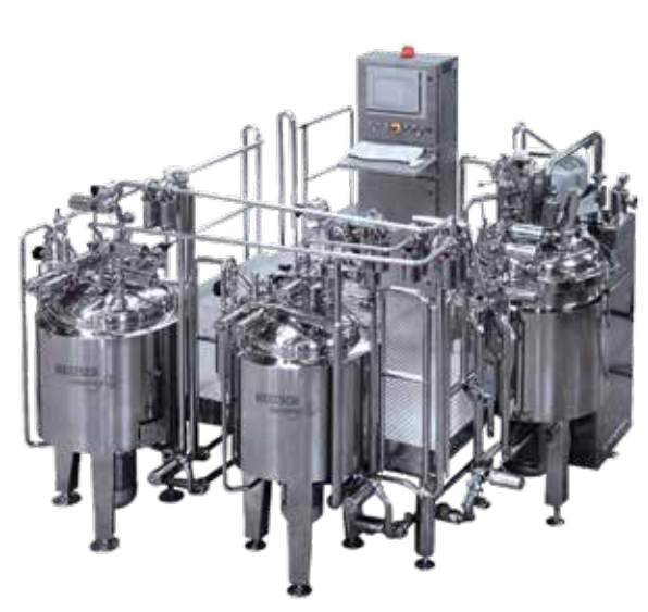
System Vita*, consisting of a KappaVita* production tank and two GammaVita* pre-phase tanks

At the heart of System VITA® plants are the KAPPAVITA®, DELTAVITA® or OMEGAVITA® dispersion machines, depending on the task at hand. They are supplemented by GAMMAVITA® premix vessels as pre-dispersion and/or charging tanks. Tailored to your application, this results in individual combinations of different technologies and machine types.