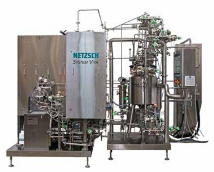
System Vita®, comprising a DeltaVita® agitator bead mill and a GammaVita® premix vessel